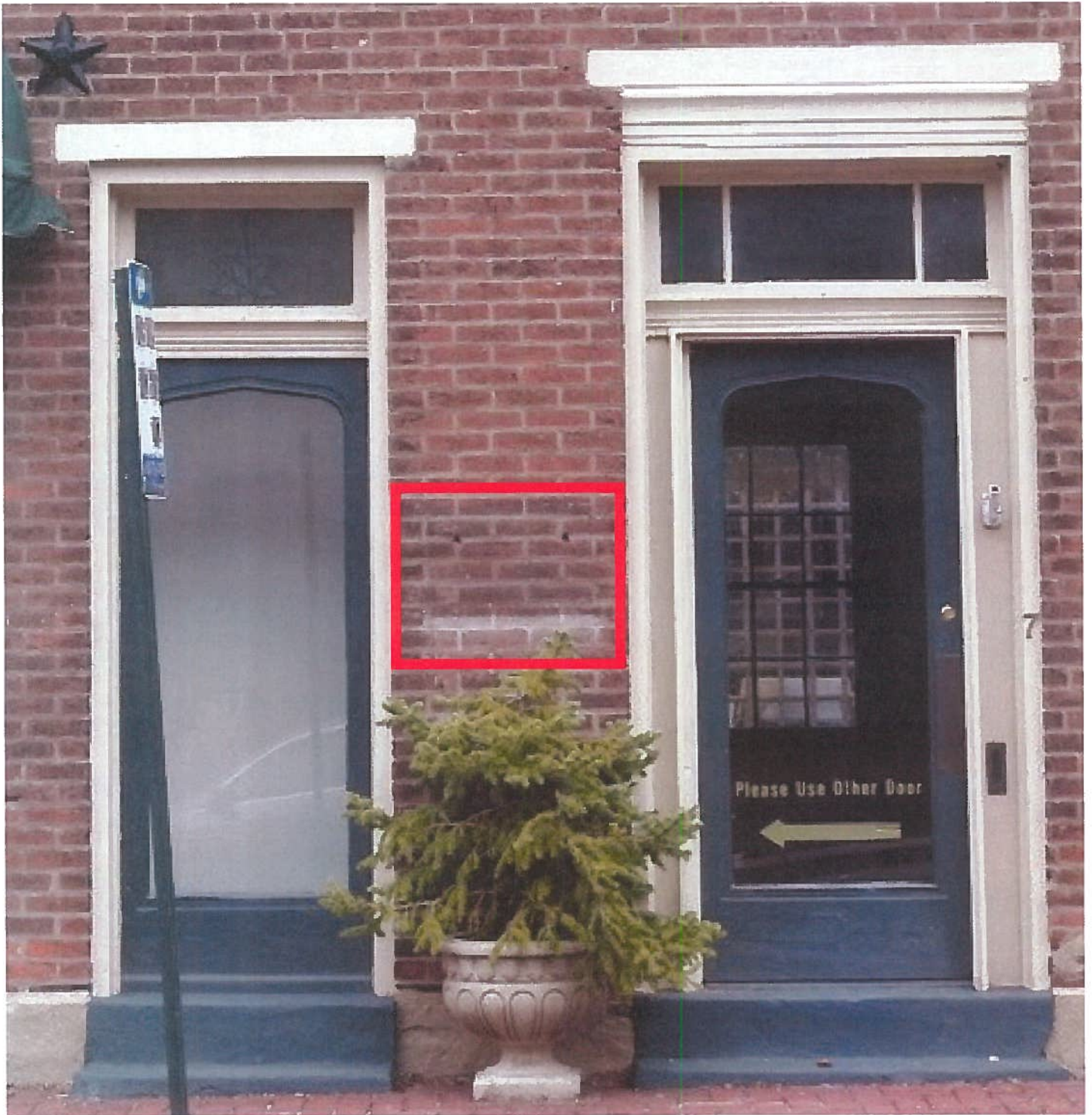
RED SQUARE INDICATES WHERE PREVIOUS TENNANT'S SIGN WAS LOCATED NEW SIGN WOULD FIT INSIDE RED SQUARE